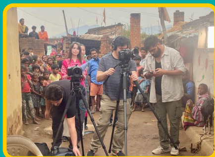
Media Team from Effect Hope Canada in Bihar