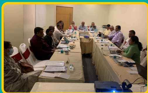
Management Committee & General Body Meeting