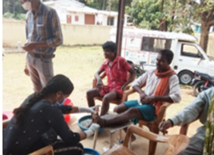
Self care camps at Samara PHC, Jagdalpur Referral Centre