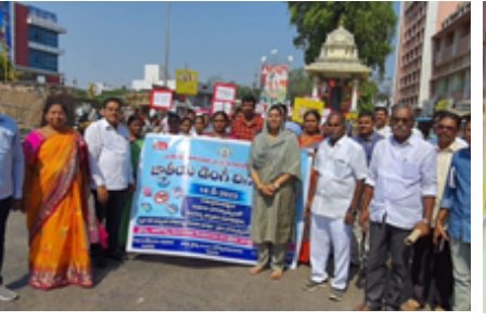
Participation in World Dengue Day Tenali, Krishna district