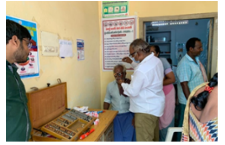
Mega Eye Health Screening Camp, Gopavaram village, Krishna district