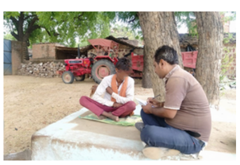
Peer Counselling Session to Leprosy Patient

JAGRUTI Projects Annual Review: Jagruti is a unique, integrated NTDs and WASH project implemented by LEPRA with support of American Leprosy Missions (ALM) in Bihar since February 2021. The three year project covers 130 villages of Kalyanpur block in Samastipur district, Bihar, and aims to reduce risk of transmission of endemic NTDs among at-risk communities and reduce the negative impact of chronic, disabling NTDs like leprosy and lymphatic filariasis among people affected. 4 Pilot Concepts added to project during 2nd Year of Implementation are Health Systems Strengthening, Integrated Footwear Unit, Livelihoods Support and People led Advocacy. The Project Annual Review was carried out during 9-11 May, 2023 lead by ALM Team. The Purpose is to review Year 2 achievements, challenges, lessons learned and to plan Year 3 key activities and deliverables