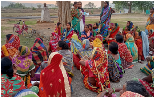
SHG federation meeting on leprosy and LF @ Ruansi village, Mayurbanj