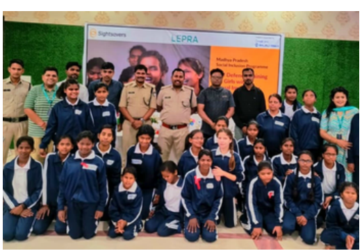
Girl Children with Visual Impairments (CVIs) Trained on Self Défense and Provision of Smart Phone