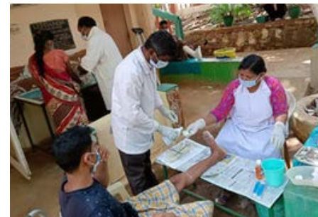
In-Patient care at Koraput Care Centre