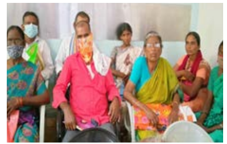
PLHIV motivated for Cataract surgeries Krishna district