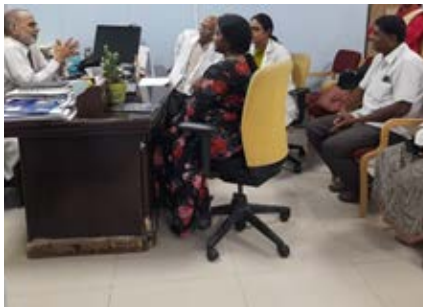
Discussions to setup a Referral Centre @ Malla Reddy Institute of Medical Sciences, Hyderabad