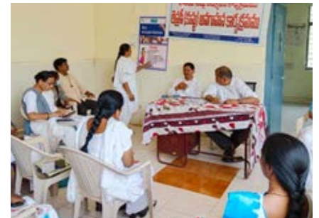
Leprosy Awareness Programme, Jainoor PHC , Kumrambheem district