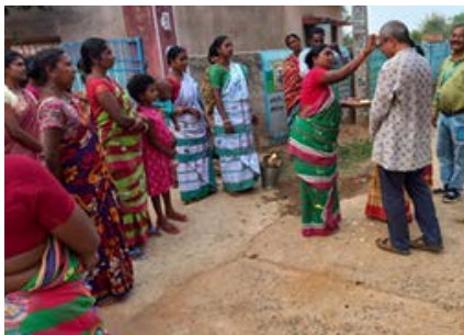
CE's visit to MAYURLEP project