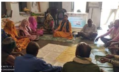
Samarth Project - Mindfulness Activity