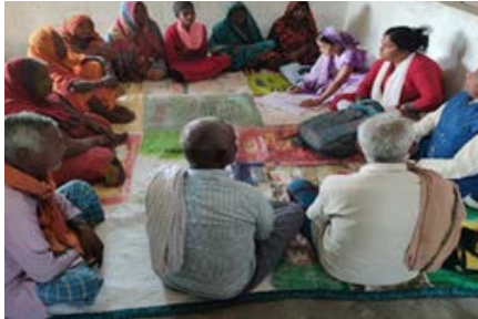
Social entitlement to People Affected by Leprosy