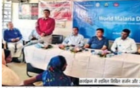
World Malaria Day Dhanbad district, Jharkhand state