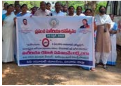
World Malaria Day Rally at Nuzvid Area Hospital, Krishna district