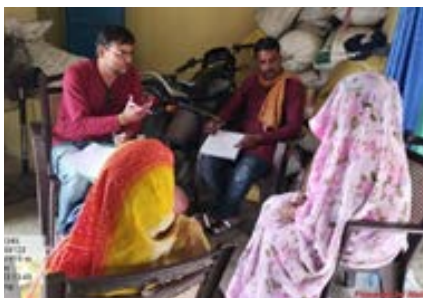
Peer Counsellor Intervention