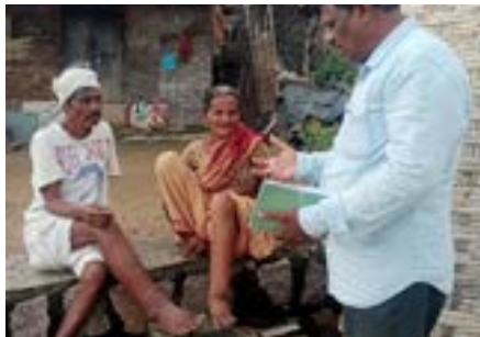
Contact survey and LF line list, Medipally village, Nirmal district