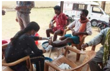
DPMR Clinic Nangur CHC