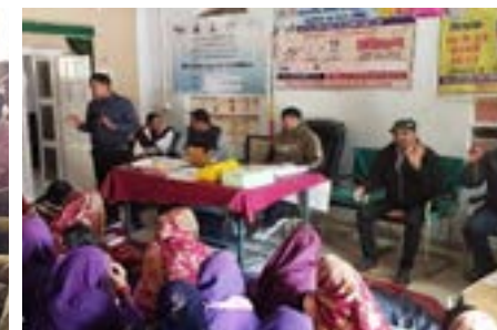
Training on Leprosy to ASHAs

Please also find the link to access for Update (March 2023) on Leprosy and Lymphatic Filariasis Major Programme Achievements & Newspaper clippings