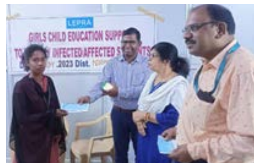
Educational Support given by Nuapada District Authorities, Odisha