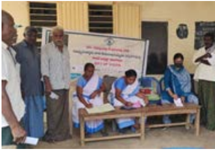
Mega Eye Screening Camp, Musunuru village, Krishna district