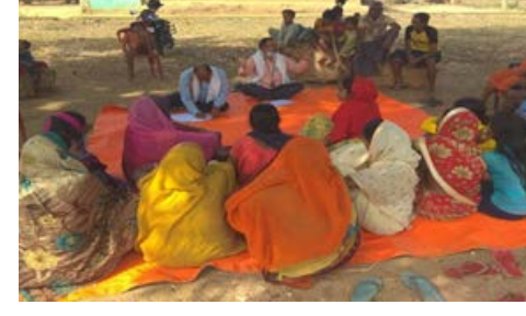
Self Support Groups meeting at Jhajha , Bihar state