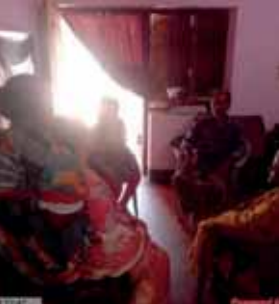
Focal Group Discussions in Kanas and Odagaon blocks