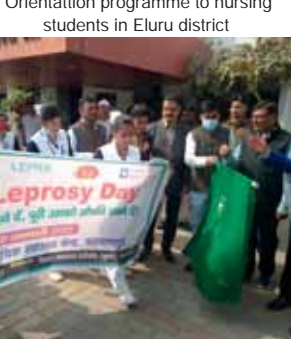
Flagging off a rally in Kalyanpur district