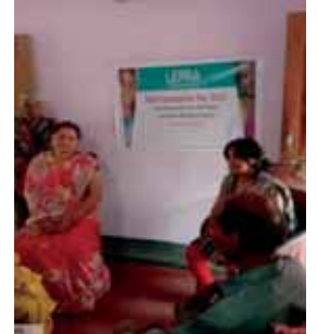
LEPRA Foundation Day celebrations, Kanas & Odagaon blocsk