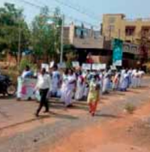
Awareness rally in Nuzvid Area