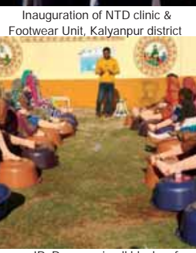
IPoD camps in all blocks of SAMARTH project